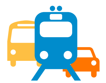
Provides Alternate Transportation Options